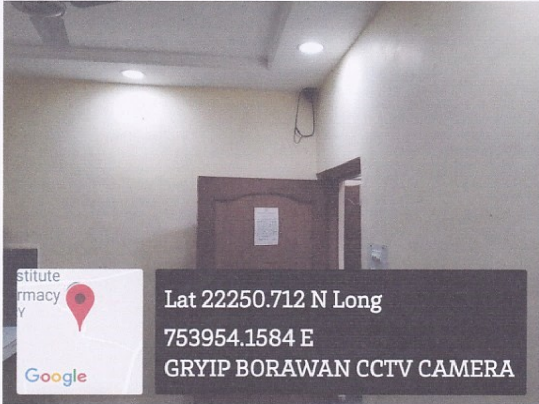
CCTV in class rooms and labs